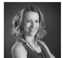
Line Grantham Yoga 1 & 2